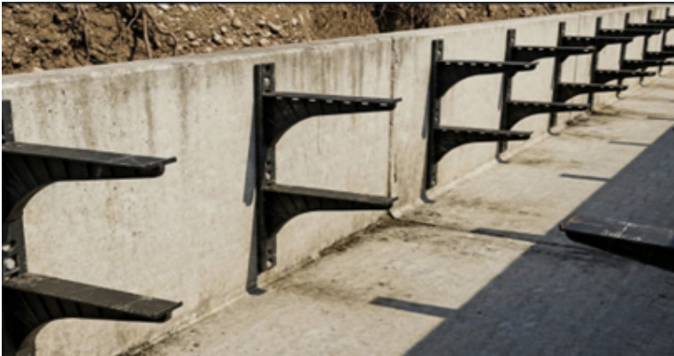
Hangers shown in a typical concrete trough installation